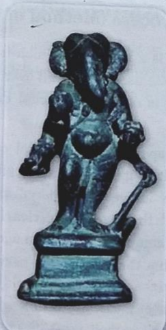
Ganesha, Kashmir, 7th century A.D.