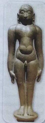
Jain Tirthankara, Mysore, 10th-11th century A.D.

Interesting images of Jain Tirthankaras, Buddha, Bodhisattva and Hindu deities have also been found from different part of India which belongs to the Kushana, Gupta and post-Gupta periods in north India during 2nd century A.D. to 7th century A.D. This process of making idols is continued to till now.