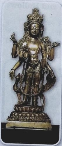
Bodhisattva, Manjushri, 9th century A.D., Kashmir