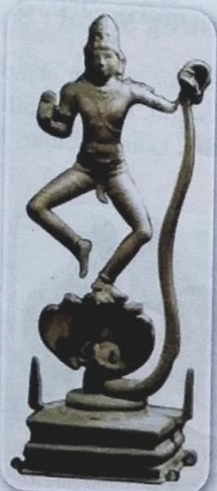
Kaliya-Krishna, Chola Period, Tamil Nadu