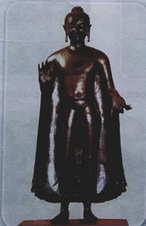
Buddha Bihar, Sultanganj Circa 7th-8th centuries