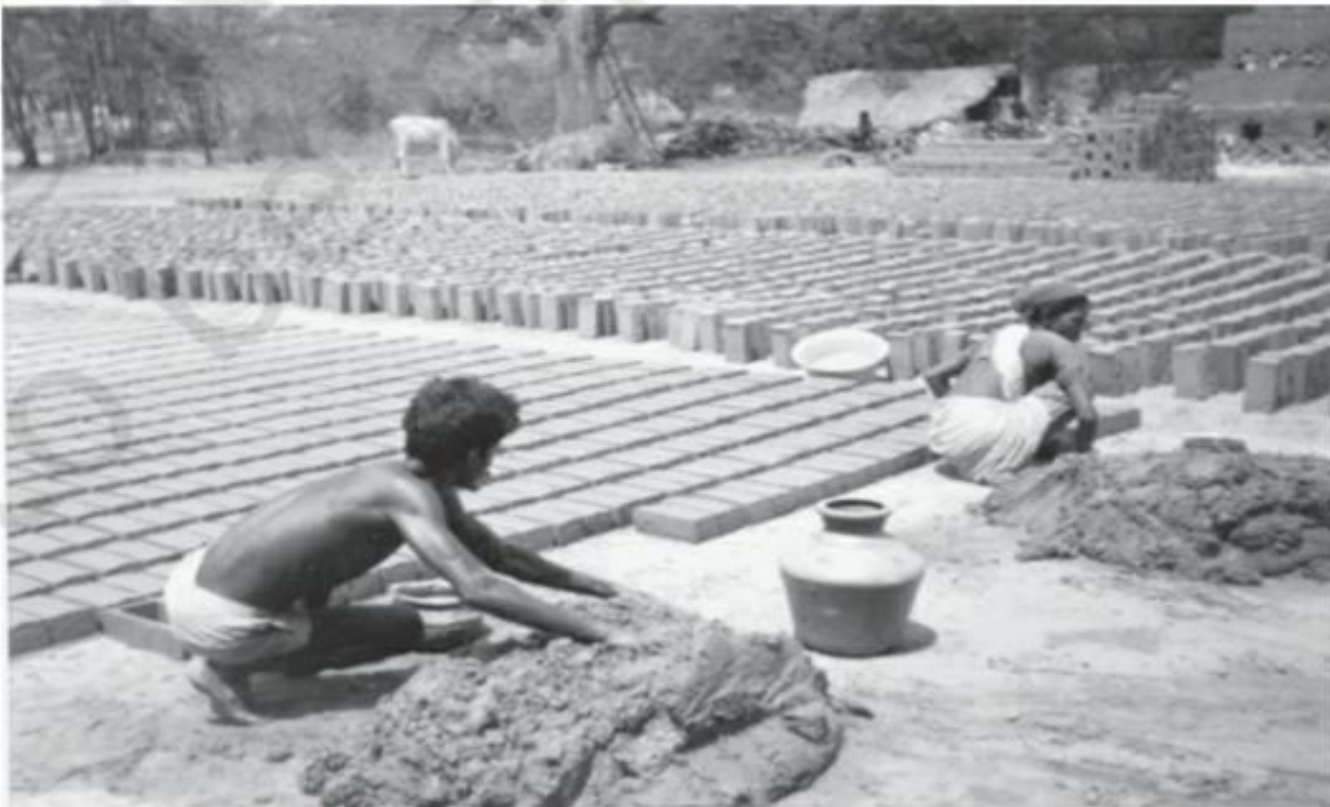
Fig. 7.2 Brick-making: a form of casual work

you will notice that self-employment is a major source of livelihood for both men and women as this category accounts for more than 50 per cent of the workforce. Casual wage work is the second major source for both men and women, a little more so for the latter (24-27 per cent). When it comes to regular salaried employment, both women and men are found to be so engaged in greater proportion. Men form 23 per cent whereas women form 21 per cent. The gap between men and women is very less. When we compare the distribution of workforce in rural and urban areas in Chart 7.2 you will notice that the self-employed and casual wage labourers are found more in rural areas than in