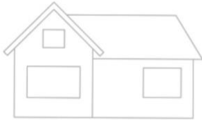
Step 5 – Draw the Door