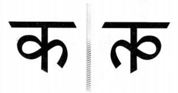
Lateral inversion by a plane mirror

Lateral inversion: Right side of the object appears as left side in the image formed by a plane mirror. For example, if we show our right hand, image in the mirror will show as left hand.