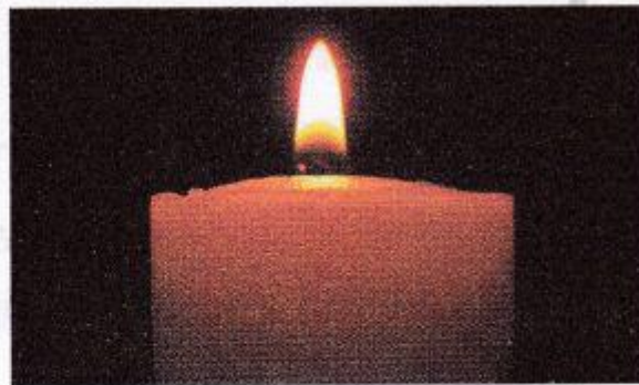
(a) Firefly: natural source of light (b) Candle: artificial source of light