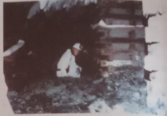
A Gold mine in Johannesburg

Animal rearing is an important occupation. While sheep are reared in the cooler and drier regions, cattle rearing is practiced in warmer and wetter areas in the eastern part. Sheep are reared for wool. Merino and Angora are two good breeds of sheep that yield high variety of wool. Dairy products like butter and cheese are produced for export. Meat and leather are also obtained from the cattle reared here.