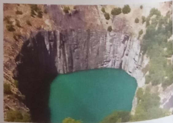
Kimberley Diamond mine

The Veld has rich reserves of gold, uranium, diamond, coal and iron ore. While Johannesburg is famous as the gold capital of the world, Kimberley is famous for the diamond mines. Several mineral-based industries like iron and steel, metal products, machinery, railway equipment and diamond industries have come up in this region. Certain agro-based industries of the region are woollen textiles, food processing, dairy and leather products. The presence of industries has promoted excellent network of roads and railways. Major cities are also connected by airways.