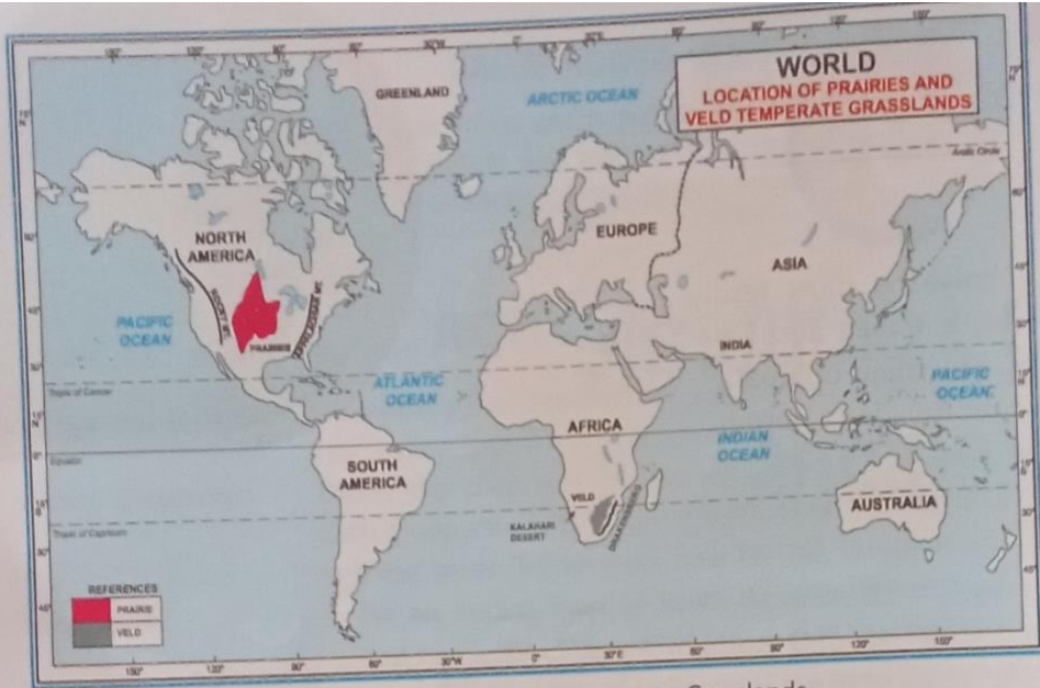
WORLD: Prairies and Veld Temperate Grasslands

above 20°C. The difference between day and night temperatures is also very high. The region experiences moderate annual rainfall around 50 cm which occurs mainly in the spring and summer season. There is snowfall in the winter season. In the absence of any natural barrier, strong warm winds blow down the eastern slopes of Rocky mountains. These are called the 'Chinook' winds.